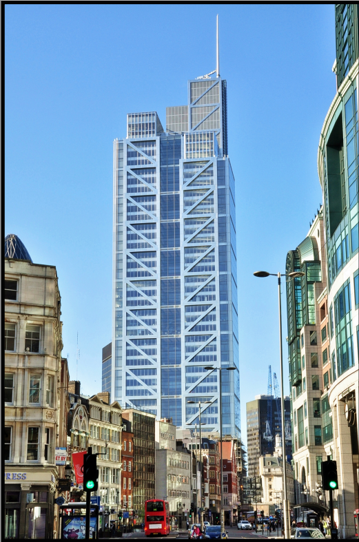
Above: The Heron Building in London which is the same size as the proposed turbines right across the Cambrians... Note the size of the red London bus at the bottom of the photo for scale..

All this before a single pylon or turbine is up and running!